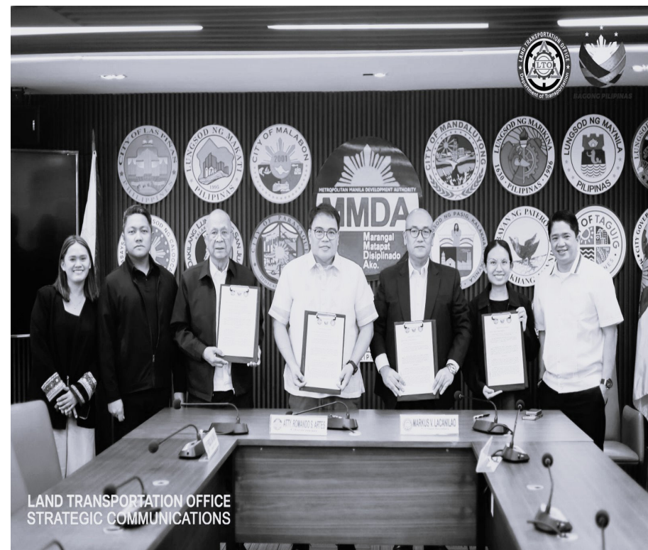
LAND TRANSPORTATION OFFICE STRATEGIC COMMUNICATIONS